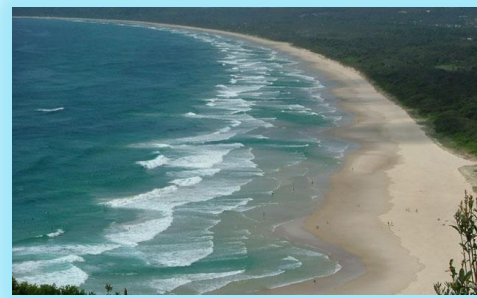
beach rips – vary always due to conditions