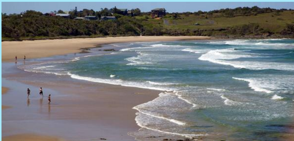
Rip's dark gaps between white-water (waves on sandbanks)

To describe a rip in its simplest form - it is a flow of water generated by the breaking waves, that runs away from the beach. The waves break in the shallower water (sandbanks) and the rips flow in the deeper channels alongside the sandbanks