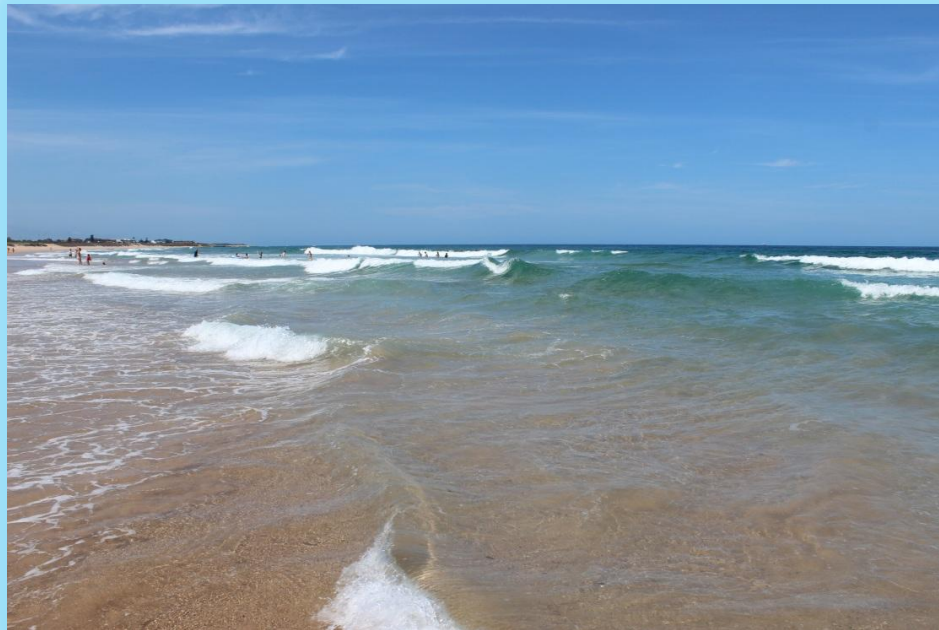
Swimming area, with rip to the side

Waves are enormous amounts of water travelling into the beach, a large breaking wave can be turbulent at first, however it is difficult for most swimmers to get to this area without using a rip. Once a rip connects back into the wave area the water will push swimmers back towards the beach.