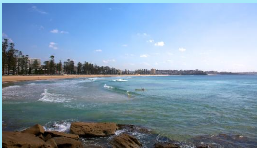
Headland rips – mostly fixed

Most rips sit in between sandbanks so it is quite easy to see the deeper water channels between the white-water on the sandbanks. Because the water is deeper it is darker in colour. Most rips have feeder currents that run off the sandbanks along the beach until they flow into the main channel, because it is deeper the waves will not be breaking in these areas. Rips can sometimes be difficult to see when there is a lot of wind, or at high tide when there is not as much water moving